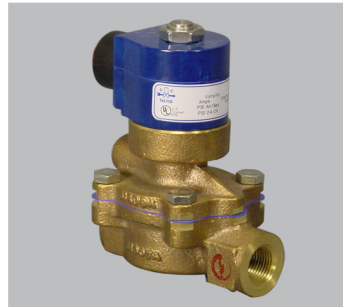
STEAM | HOT WATER ANTI-WATER HAMMER