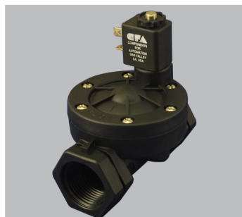
DRINKING WATER | LEAD FREE | NSF 61