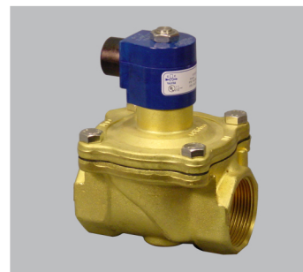
ZERO PRESSURE DIFFERENTIAL TO 2" NPT