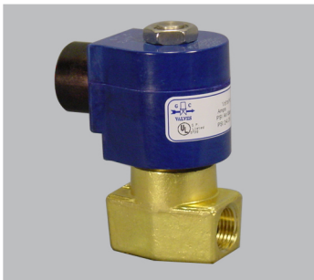
UL SAFETY SHUTOFF | CSA | NEMA 7