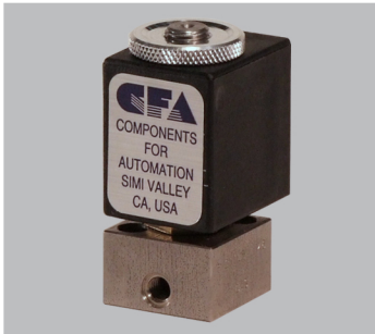
AIR | GASES | INSTRUMENTATION