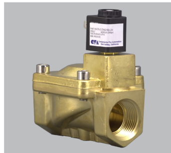
WATER | LIGHT OIL | SIMILAR LIQUIDS